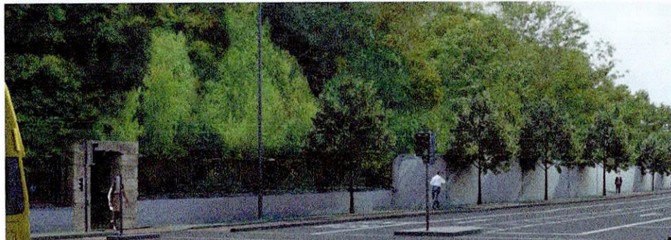
The existing wall (above) and the proposed wall (below)